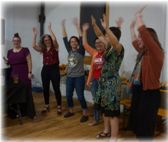
The winning trivia team celebrates at Ozark Beer Co. in Rogers.

Special for this year's conference was an additional silent auction for pies. During Kat Robinson's closing session, conference participants bid on a variety of pies from local bakeries, including apple, blueberry, mockingbird, key lime, rhubarb, and raisin, raising $450 for scholarships.