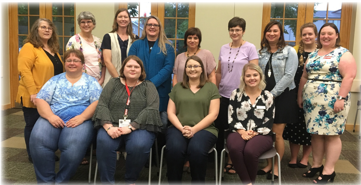
ALPS Pre-Conference Networking. On Friday evening, September 21, ALPS members attended a reception and open house at Bentonville Public Library. More than 20 people enjoyed yummy snacks and a private tour of the facility.