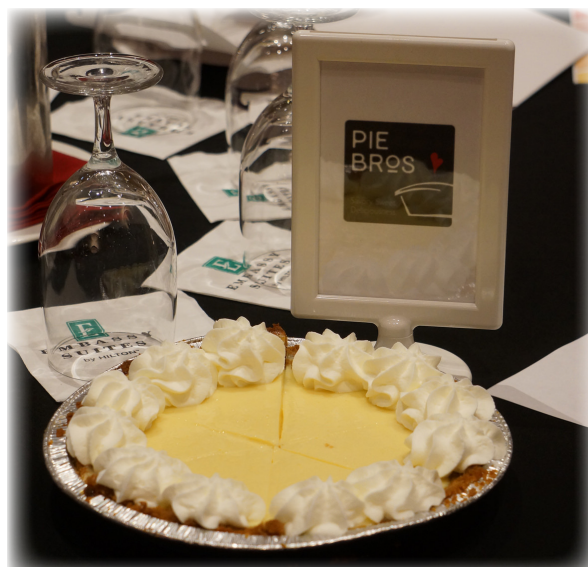
A pie up for auction (please see article on page 4).