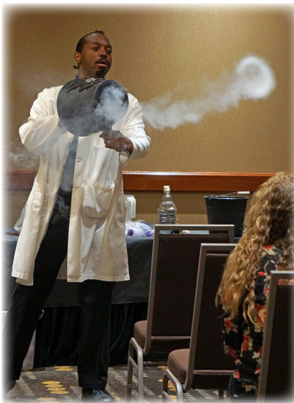
The Nitro Joe Science Show.