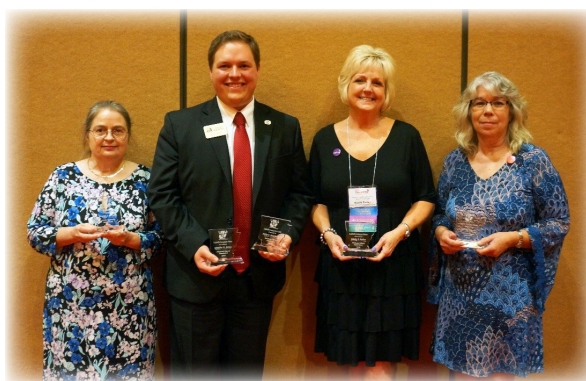
Members of the Staff of South Arkansas Community College.