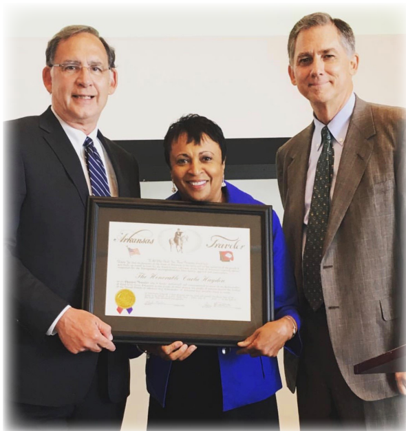
Senator Boozman (left) presents Librarian of Congress Carla Hayden with the Arkansas Traveler Award. Congressman Hill (right) invited Dr. Hayden to Arkansas where she attended a luncheon for librarians in the state.

The Library preserves and provides access to a rich, diverse and enduring source of knowledge to inform, inspire and engage citizens in their intellectual and creative endeavors. Find out more about the Library of Congress at https://www.loc.gov/ .