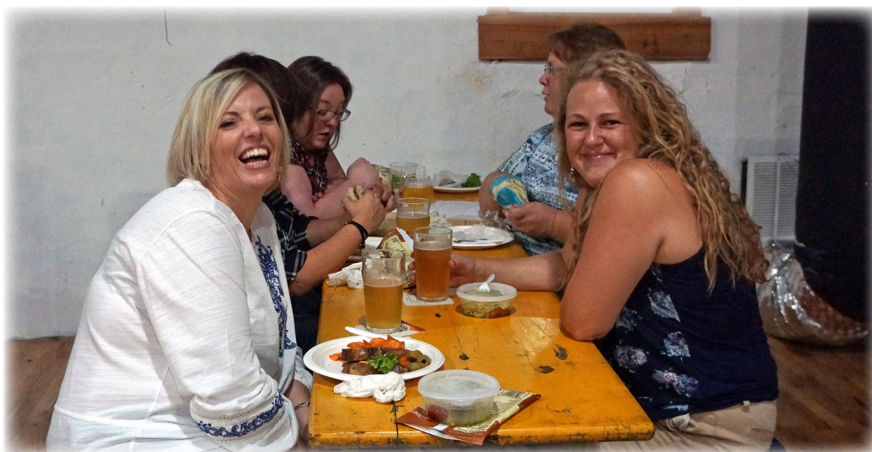
Trivia participants enjoy food and libations at Ozark Beer Co. in Rogers (please see article on page 4).