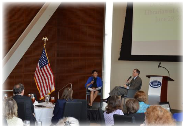
Congressman French Hill leads a conversation with Dr. Carla Hayden at a luncheon that attracted over 100 librarians from around the state.

Congressman Hill said, "Your work in our communities is essential for a connected and educated citizen-led republic. I am honored to serve Arkansas in the U.S. House of Representatives and to help you access these excellent Library of Congress resources."