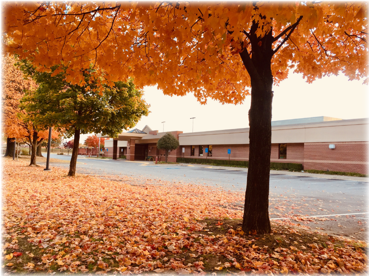
Springdale Public Library with fall colors.

Non-Profit Organization U.S. Postage PAID Little Rock AR Permit #2685