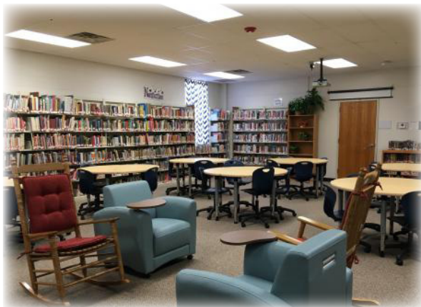
The library at Fouke High School.