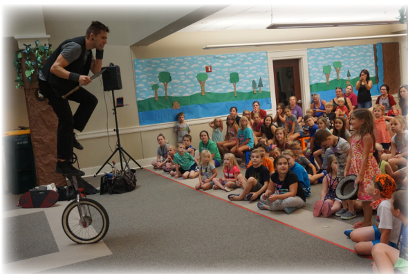
One Man Circus.

Starting in June, the Saline County Library hosted weekly programs for children, tweens, teens, and adults. Partnering with various entertainment organizations, they hosted unique programs every Monday at three different times to allow for as many