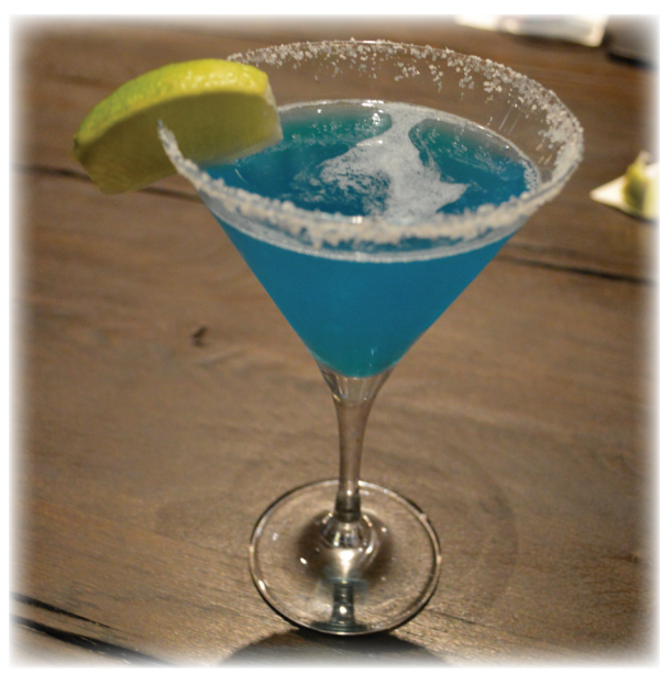
The Marriott bartenders' signature cocktail creation for all the librarian-related conferences: the Tipsy Librarian.