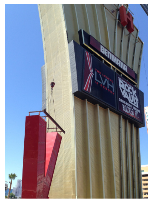
The end of an era at the Las Vegas Hotel (LVH) was evident when the "LVH" came down from the iconic marquee.

New Business featured a special resolution for Council consideration. A Resolution on Granting the District of Columbia Government Budget Autonomy to Allow City Services, including Libraries, to Remain Open during a Federal Government Shutdown passed with good support.