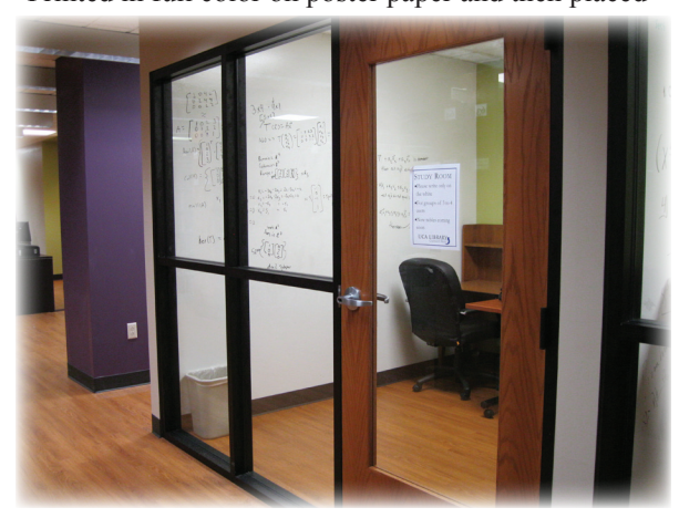
Group study room with white board painted wall. Photo submitted by Elizabeth DiPrince .

To improve access for library patrons, we redesigned signage throughout the library. Signs before the renovation were difficult to read and often used confusing terminology, making it difficult for patrons to locate collections in the library. New ADA compliant signs with a black background and large white lettering provide a clearer path to resources. We matched the verbiage on the signs with location names found in the catalog to assist patrons looking for library materials. Additionally, a graphic artist on staff helped design a library directory. This large map differentiates public and administrative areas by color and utilizes labels that correspond with signage and location terms used in the catalog. Students will find the directory at the library's front and back entrances and at the top of the library's main staircase on the second floor. Printed in full color on poster paper and then placed