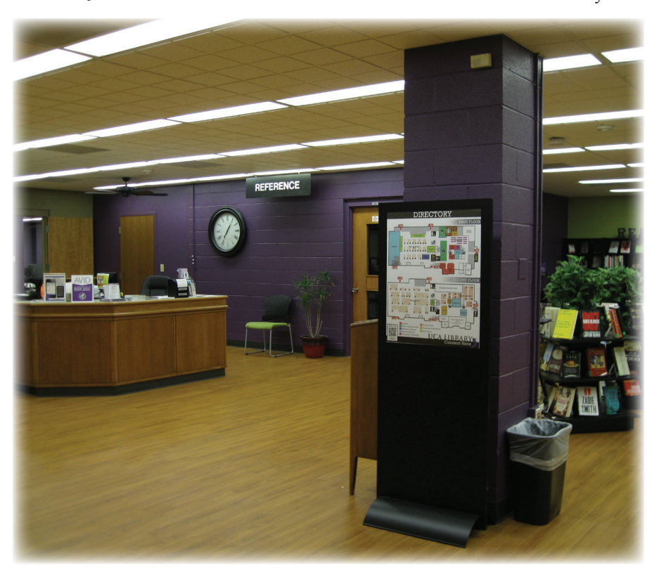
Colorful signs direct students to resources.

The reorganization of space in the west wing created an opportunity to add additional study rooms on the first floor. A consistent student complaint before the renovations was that there were never enough study rooms, especially for groups studying together. To address this issue, we built seventeen new rooms in three different sizes. Smaller rooms accommodate one to two students, medium sized rooms are for groups of three to four students, while large rooms host groups of up to six people. Glass walls in the rooms permit greater