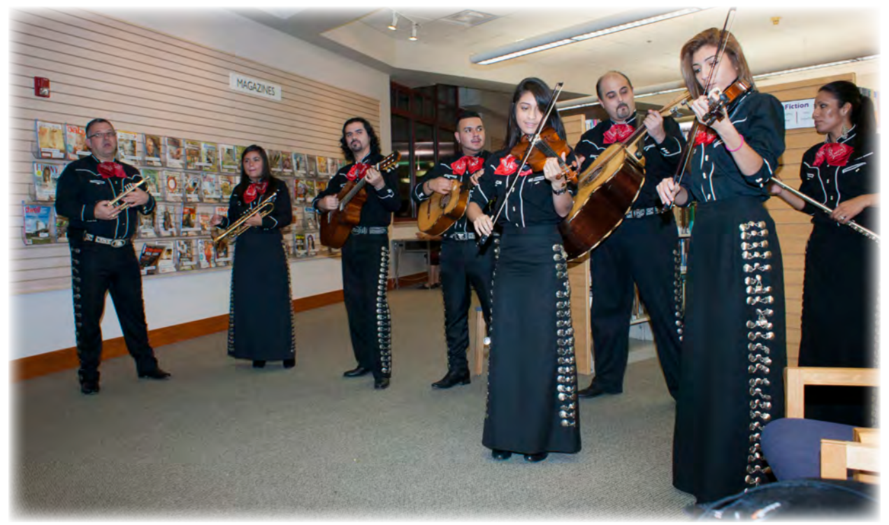
A Mariachi band entertains the crowd at the Springdale Public Library.

A new activity for LEAF was begun in 2010 with a donation on behalf of the Arkansas Library Association toward financing the Arkansas Literary Festival since that festival is an encouragement for reading and the appreciation of books and writing."