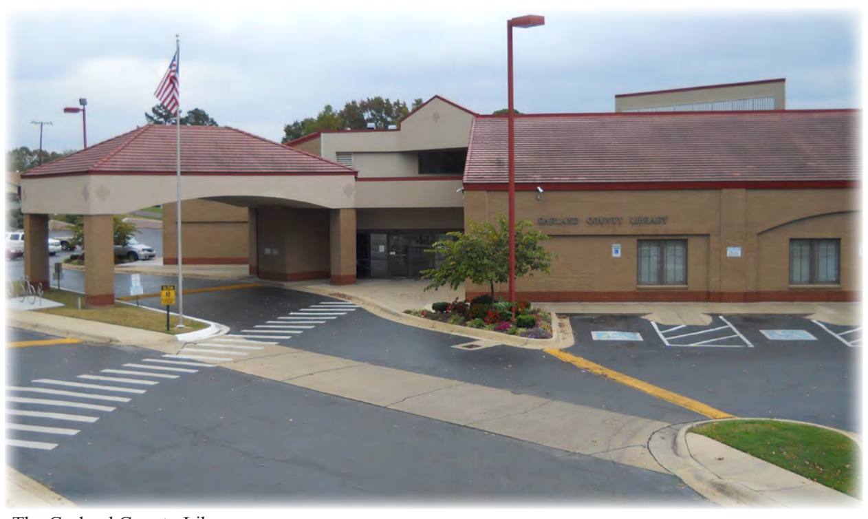
The Garland County Library

The GCL continued to operate in the same location until 1995, when a new location was found on Malvern Avenue. The county bought the land to construct a new health department building and offered the excess land for free to the library board.