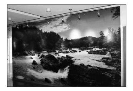
Mural of Cossatot River

Check our Web site, www.asl.lib.ar.us, or watch the Arkansas library listservs for an announcement about an upcoming Open House for the building.