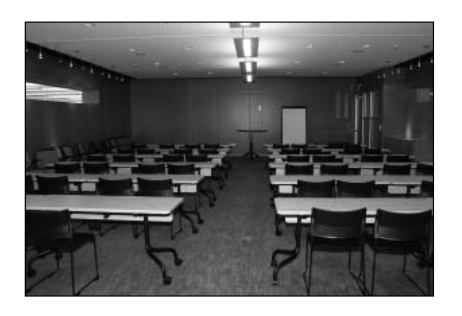
Bessie B. Moore Conference Room