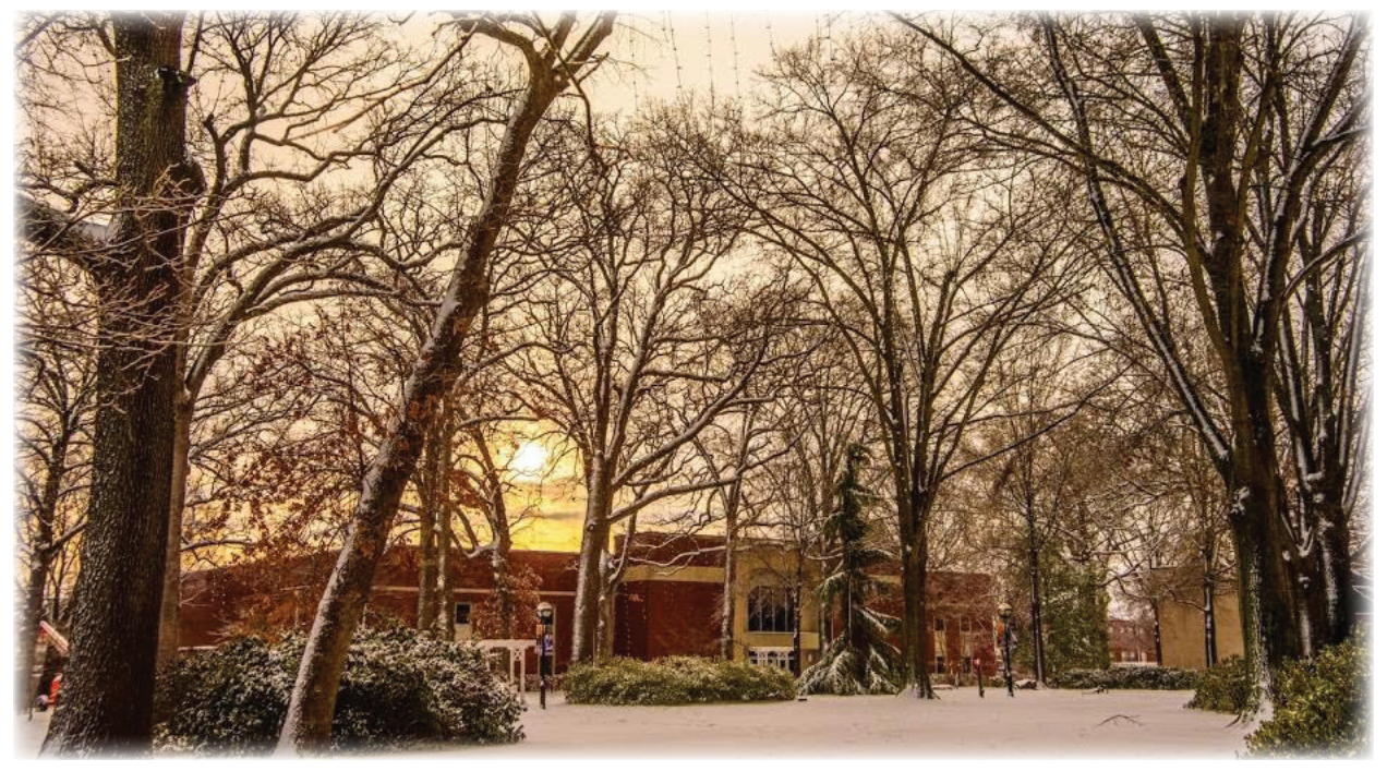
Winter scene at Brackett Library, Harding University.

A reminder to Arkansas librarians: please submit news items to me for the next Arkansas Libraries issue! Births, deaths, new hires, retirements, funding, new buildings, and news that affects Arkansas libraries would be perfect fits for this column. Just jot me an email at <u>hhays@</u> <u>bentonvillear.com</u>, and you'll most likely see it published in our journal.