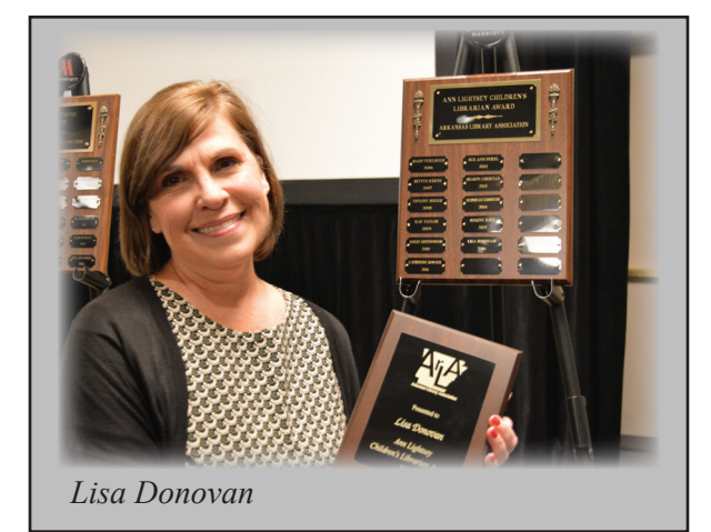
16 Arkansas Libraries Vol. 73, No. 4