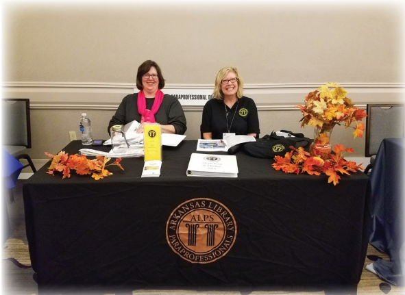
Arkansas Libraries, Winter 2016 15